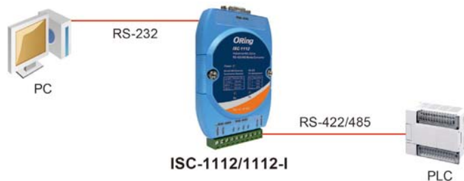
Connections of Serial Media Converter

ISC-1112 series are industrial media converters provide media conversion between RS-232 and RS-422/485 interface. ISC-1112 series are ABS housing design and supporting an operating temperature of -10 to 70 °C. The RS-485 control is completely transparent to the user and software written for half-duplex operation without any modification. ISC-1112-I opto-isolators provide 3000VDC of isolation to protect the host computer from destructive voltage spikes. Therefore, the ISC-1112 series is reliable serial media converter and can satisfy most demand of operating environment.