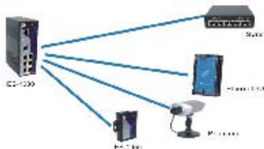
Connections of Ethernet devices

IES-1080/1062 series can be used in connecting several Ethernet devices like Ethernet I/O, IP-Camera or other Ethernet switches. In addition, there are three different power inputs to enhance its reliability, two supplied by terminal block, and one by power jack to avoid interruption caused by power down. When the primary DC power input fails, the backup power input will take over immediately to guarantee a non-stop operation.