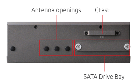
MXE-1400 Series Front Panel