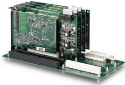
SSi bus cable for multiple cards synchronization