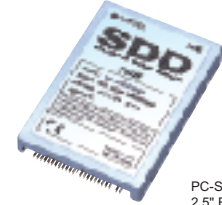
PC-SDD V series 2.5" Form Factor