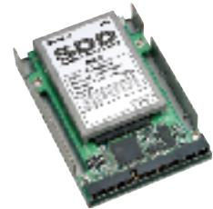
PC-SDD V3-SCH series