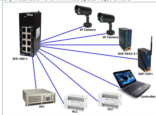
Connections of Ethernet devices

IES-180-L can be used in connecting several Ethernet devices like Ethernet I/O, IP-Camera or other Ethernet switches. In addition, its mini size enables easily installation and minimize space requirement.