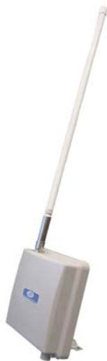
* Example of Installation with optional antenna

IAP-6701N-WG+ is a reliable IP-67 outdoor IEEE 802.11 b/g WLAN Access Point with 1 PoE P.D. Ethernet port. It can be configured to operate in AP/Bridge/Repeater/AP-Client/Client mode. It is specifically designed for the toughest industrial environments. In combination with its IP-67 design and the superb management functionality. IAP-6701N-WG+ provide a waterproof, and dust-tight connection. And IAP-6701N-WG+ provide one N-type connector, that can install any N-type antenna to extended communication distance. You are able to configure IAP-6701N-WG+ by WEB interface via LAN port or WLAN interface. In addition, IAP-6701N-WG+ also provides P.D. feature which is fully compliant with IEEE802.3af PoE P.D. specification to save the layout cost of power line. The IAP-6701N-WG+ can be easily adopted in almost all kinds of applications and provides the most rugged solutions for managing your network in outdoor. Therefore, IAP-6701N-WG+ is one of the best outdoor communication solutions for wireless applications.