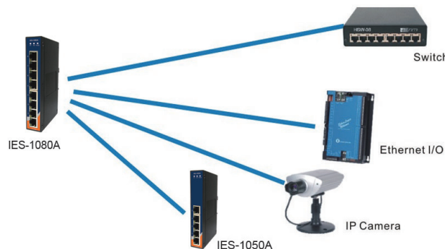
Connections of Ethernet devices

IES-1050A/1080A can be used in connecting several Ethernet devices like Ethernet I/O, IP-Camera or other Ethernet switches. In addition, there are two different power inputs at terminal block to avoid interruption caused by power down. When the primary DC power input fails, the backup power input will take over immediately to guarantee a non-stop operation.