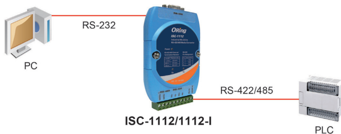
Connections of Serial Media Converter

ISC-1112 series are industrial media converters provide media conversion between RS-232 and RS-422/485 interface. ISC-1112 series are ABS housing design and supporting an operating temperature of -10 to 70°C. The RS-485 control is completely transparent to the user and software written for half-duplex operation without any modification. ISC-1112-I opto-isolators provide 3000VDC of isolation to protect the host computer from destructive voltage spikes. Therefore, the ISC-1112 series is reliable serial media converter and can satisfy most demand of operating environment.