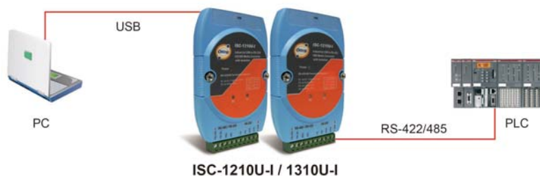
Connections of USB to Serial Media Converter

The ISC-1210U-I / ISC-1310U-I converter is an intelligent, stackable expansion module that connects to a PC USB port or USB Hub via the Universal Serial Bus(USB) port, providing one High-Speed RS-232/RS-422 or RS-485 serial port(jumper-less). The ISC-1210U-I / ISC-1310U-I features easy connectivity for traditional serial devices. The RS-232 standard supports full-duplex communication and handshaking signals (such as RTS, CTS) and The RS-485 control is completely transparent to the user and software written for half-duplex operation without any modification. The ISC-1210U-I / ISC-1310U-I's opto-isolators provide 3000 VDC of isolation to protect the host computer from destructive voltage spikes on the RS-232/RS-422 and RS-485 data lines. ISC-1210U-I / ISC-1310U-I also offer internal surge-protection on their data lines. The internal high-speed transient suppressors on each data line protect the modules from dangerous voltages levels or spikes. In addition, the ISC-1210U-I / ISC-1310U-I module derives the power from USB port and doesn't need any aid of external power adapter.