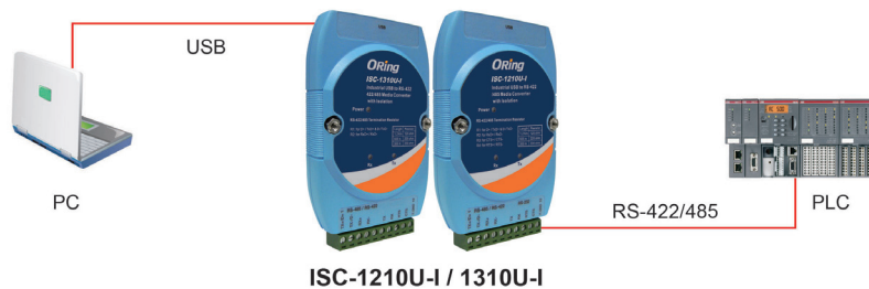
Connections of USB to Serial Media Converter

The ISC-1210U-I / ISC-1310U-I converter is an intelligent, stackable expansion module that connects to a PC USB port or USB Hub via the Universal Serial Bus(USB) port, providing one High-Speed RS-232/RS-422 or RS-485 serial port(jumper-less). The ISC-1210U-I / ISC-1310U-I features easy connectivity for traditional serial devices. The RS-232 standard supports full-duplex communication and handshaking signals (such as RTS, CTS) and the RS-485 control is completely transparent to the user and software written for half-duplex operation without any modification. The ISC-1210U-I / ISC-1310U-I's opto-isolators provide 3000 VDC of isolation to protect the host computer from destructive voltage spikes on the RS-232/RS-422 and RS-485 data lines. ISC-1210U-I / ISC-1310U-I also offer internal surge-protection on data lines. The internal high-speed transient suppressors on each data line protect the modules from dangerous voltages levels or spikes. In addition, the ISC-1210U-I / ISC-1310U-I module derives the power from USB port and doesn't need any aid of external power adapter.